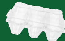
Plastic egg boxes