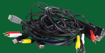
Wires and cables

Items such as fairy lights, wires, cables and electrical items can be recycled at the Recycling Centre