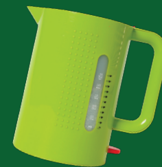
Old electrical items